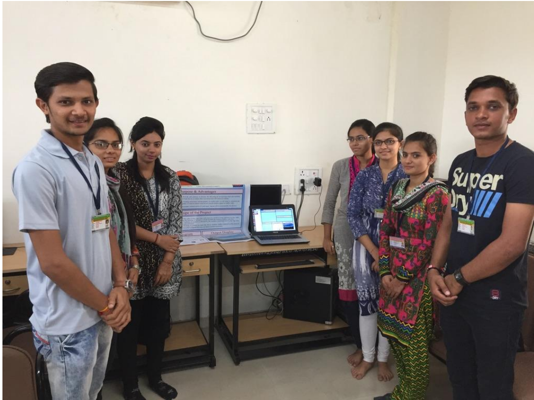
A Group of Hackathon presented their Project “Road Symbol Detection System”