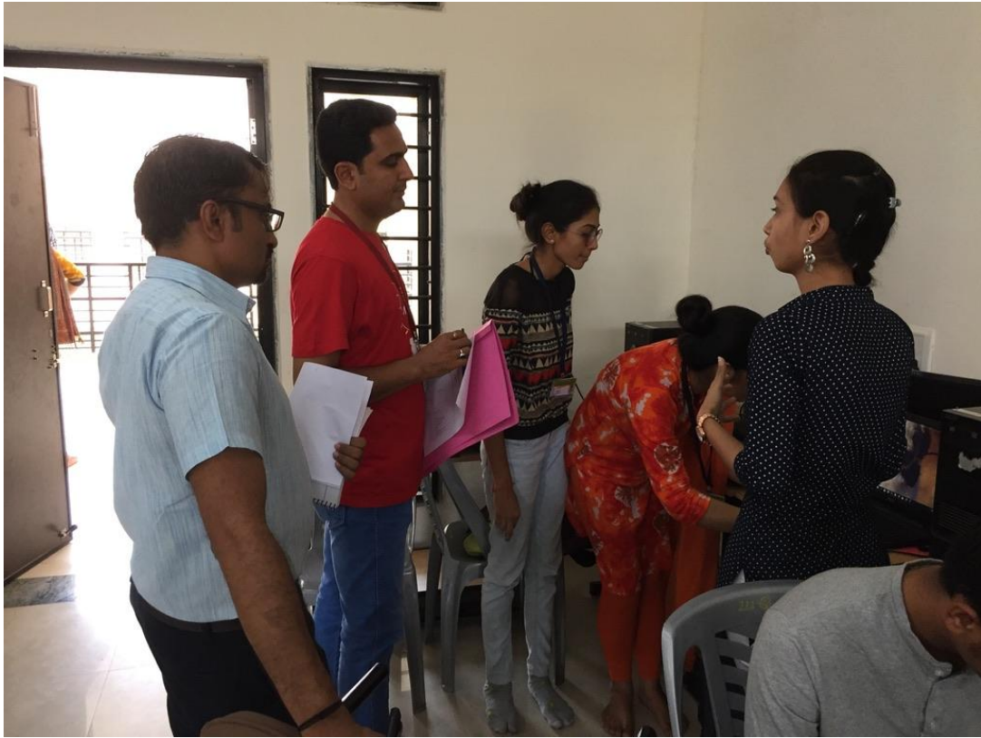
A Group of final year students secured Second Rank with their project "Triplysis"