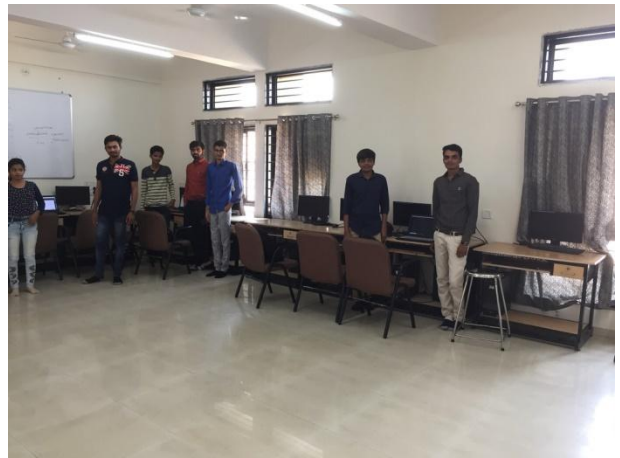
Groups of Students presenting their Projects