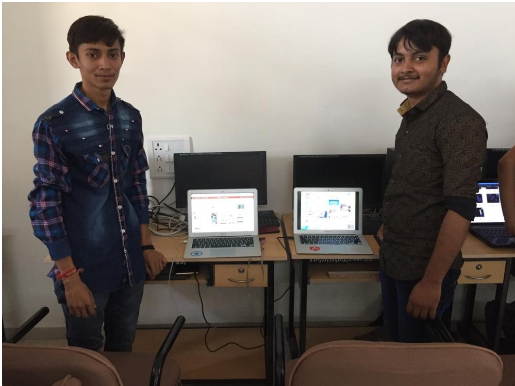
A Group of final year students secured Third Rank with their project "HALA KIWI"